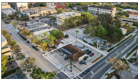
1802 Main Street Reese's Gas Station Sold - $2,300,000 • 8,600 SF