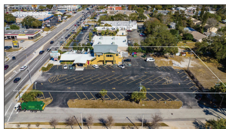
4001 S. Tamiami Trail Cafe Baci Building Sold - $2,800,000 • 7,436 SF