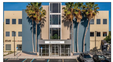
22 S. Links Avenue Stearns Bank Building Sold - $7,300,000 • 18,578 SF

THINKING OF INVESTING IN SARASOTA REAL ESTATE? CALL ME!