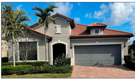
HAMMOCK PRESERVE 2BR/2BA | 1,675 SF SOLD $575,000