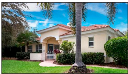
SAVANNAH AT TURTLE ROCK 4BR/3BA | 2,161 SF SOLD $575,000